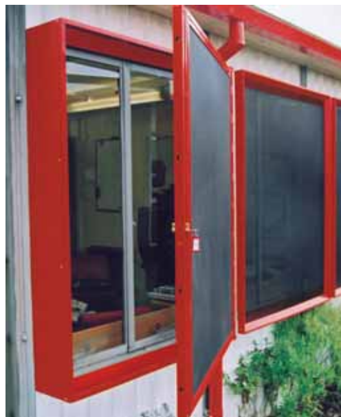
The stand-off option combined with the hinge-away.