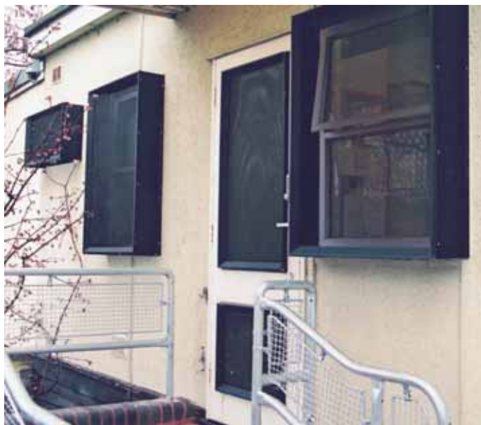
GriffinGuard stand-off option allows windows to be opened.

GriffinGuard's unique 3CR12 ferretic stainless steel mesh makes it durable and hard-wearing for the long term. Its high quality aluminium frame ensures that there are no rattles or movement and no fixings visible on the attack surface.