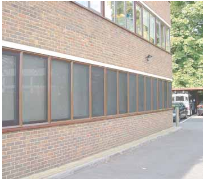
GriffinGuard does not interfere with the aesthetics of a building.