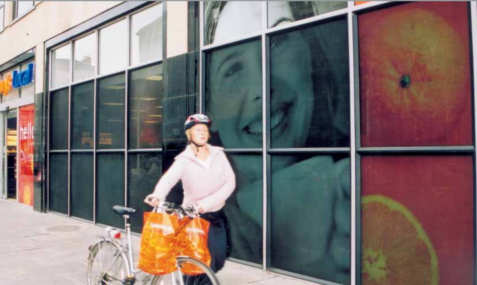
GriffinGuard allows store graphics to be seen from behind the glass whilst still protecting it from damage.