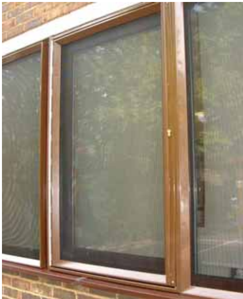
The hinge-away option allows the glass to be cleaned and offers an alternative fire escape.