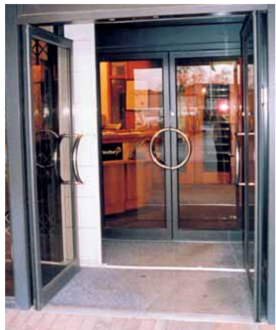
... and retracts out of sight during working hours.

The original retractable security grilles from the international market leader