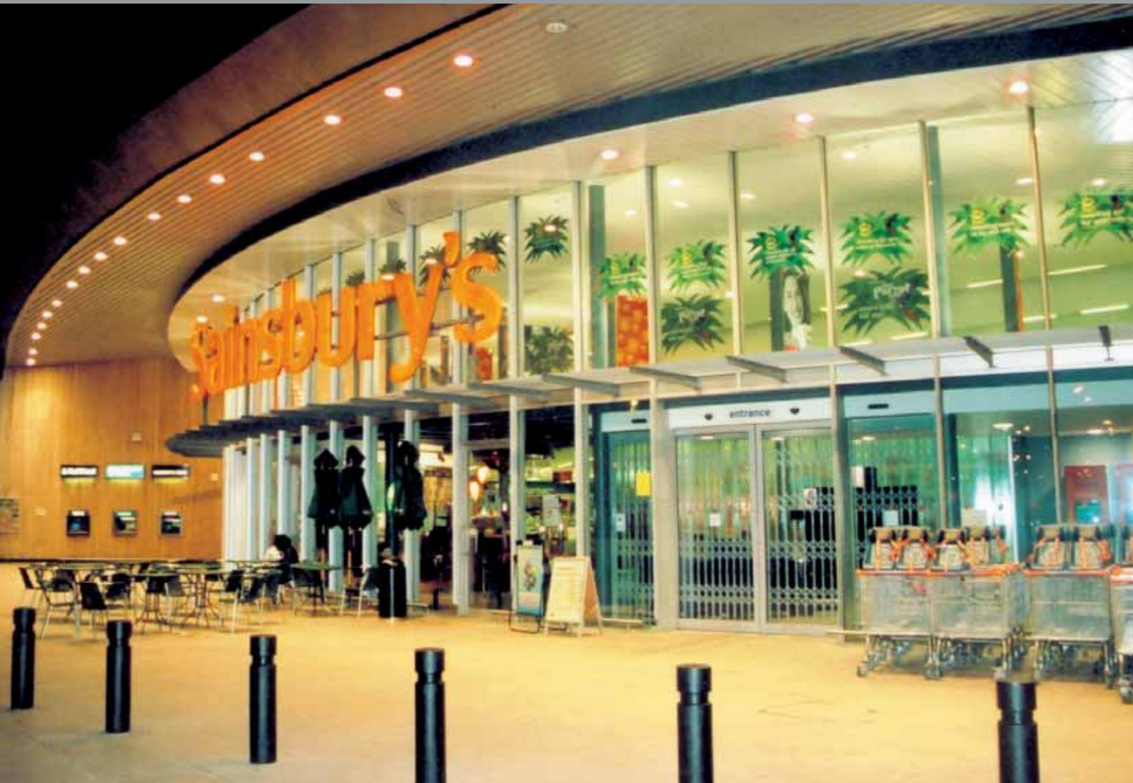
Sainsburys Greenwich Superstore