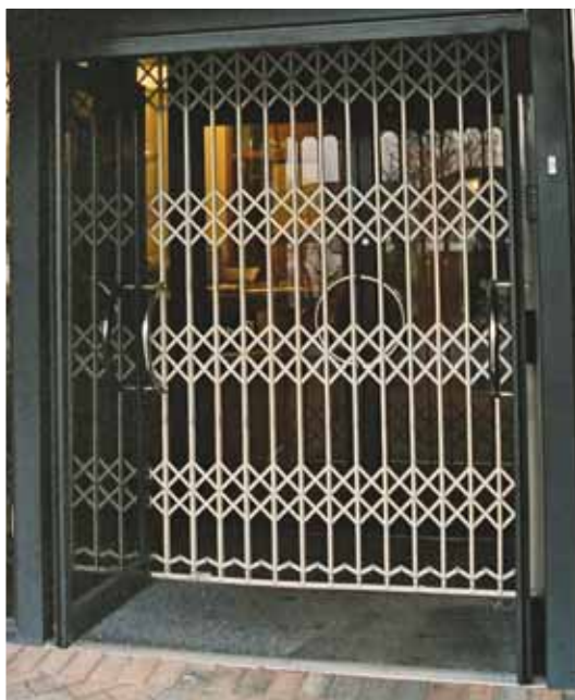
Trellidor Plus protects an entrance out of hours ...