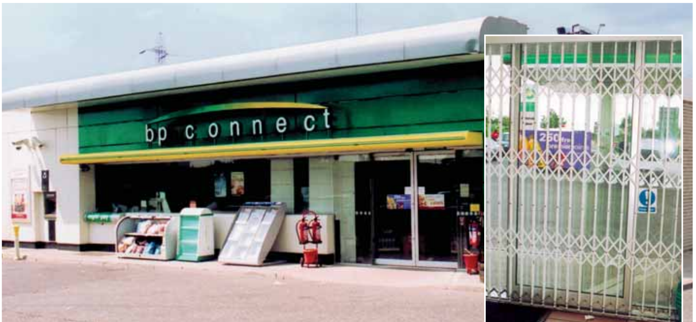
Many corporate customers such as Sainsbury's and BP specify only Trellidor Plus security grilles.